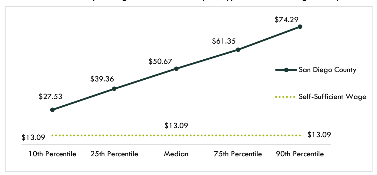
Exhibit 4: Hourly Earnings for Software Developers, Applications in San Diego County<sup>5</sup>

Software Developers, Applications earn median hourly earnings of $50.67, more than the Self-Sufficiency Standard for a single adult in San Diego County, which is $13.09 per hour (Exhibit 4).4